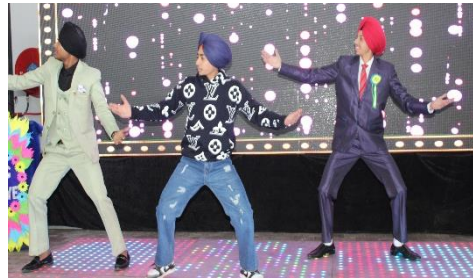
Every Ending Has