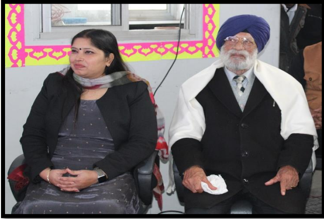
Guest of Honor